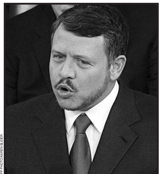
Jordan's King Abdullah speaking to Congress.

—King Abdullah II of the Hashemite Kingdom of Jordan in his address to Congress, March 7, 2007.