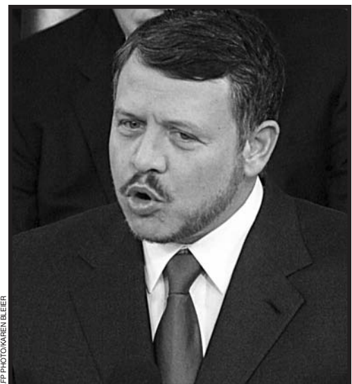
Jordan's King Abdullah speaking to Congress.

—King Abdullah II of the Hashemite Kingdom of Jordan in his address to Congress, March 7, 2007.