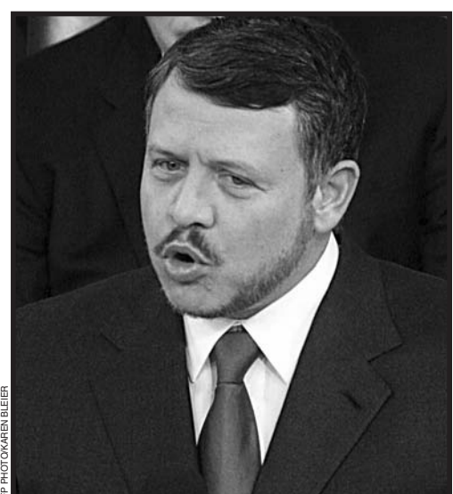
Jordan's King Abdullah speaking to Congress.

—King Abdullah II of the Hashemite Kingdom of Jordan in his address to Congress, March 7, 2007.